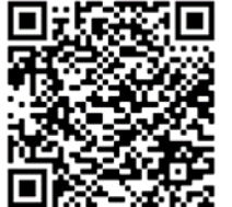
Discipleship Survey QR Code