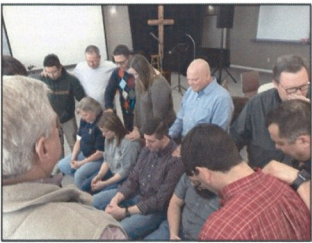
Left: Canadian Baptist leaders pray over leaders from Multiply Church, commissioning them for their new work which launched Feb. 25.